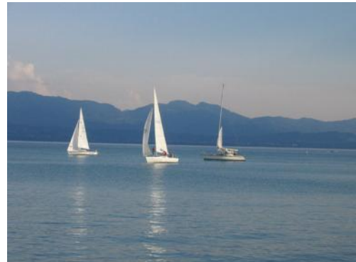
Sailing across to Evian in light winds

Evian sail Trip 2011: 3 boats + 18 participants