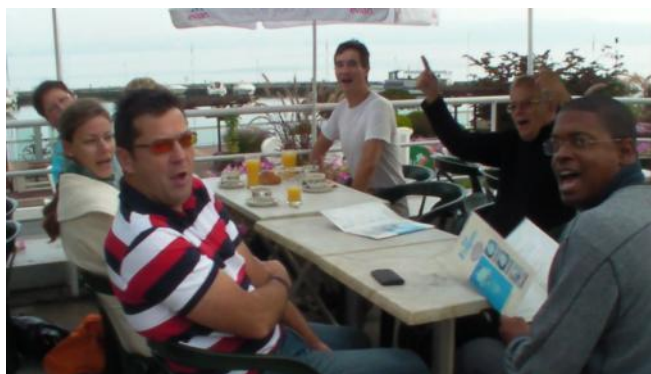
Crew singing happy birthday over breakfast