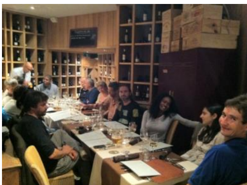
Dinner at the vinotheque

Night time arrangements varied quite a bit; some took the last ferry ride back to Lausanne after supper, but the large majority slept on the three boats with an early wakeup to the sounds of hungry ducks. With such splendid weather, the boat rides back to Pully, Morges, and Geneva was just the best way to spend a Sunday in the sun.