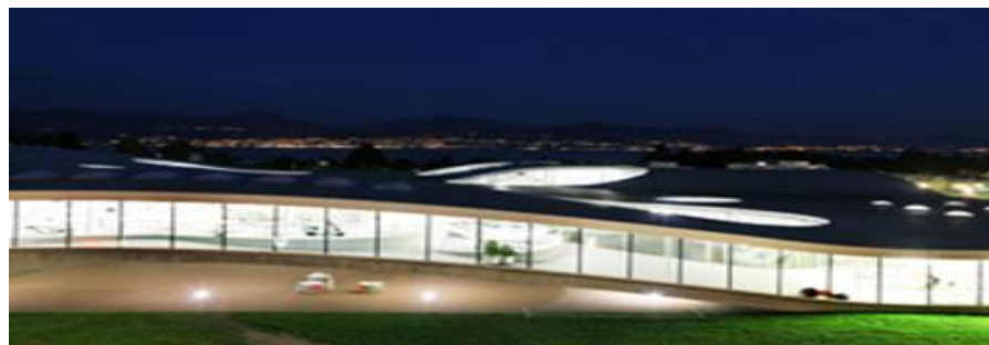
Event always take place at the Rolex learning Center

For those of you that are not aware, this is a unique opportunity for participants to meet several recruiters and HR directors face to face from top Swiss companies in a relaxed environment. Following the speed interviews, a cocktail will be provided for allowing everyone further networking opportunities. Due to organisational reasons, the Speed Interviewing event has been postponed from October 4th 2011 to March 20th 2012. More details will be posted on our web page as the event approaches.